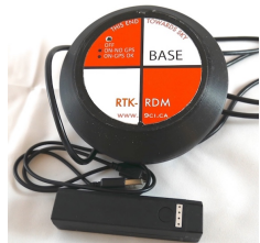
2 = Base Unit +