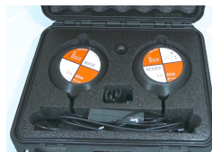
5 = Case