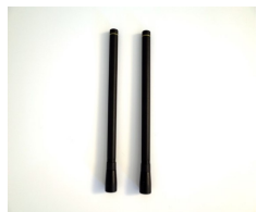
1 = Antennas x 2